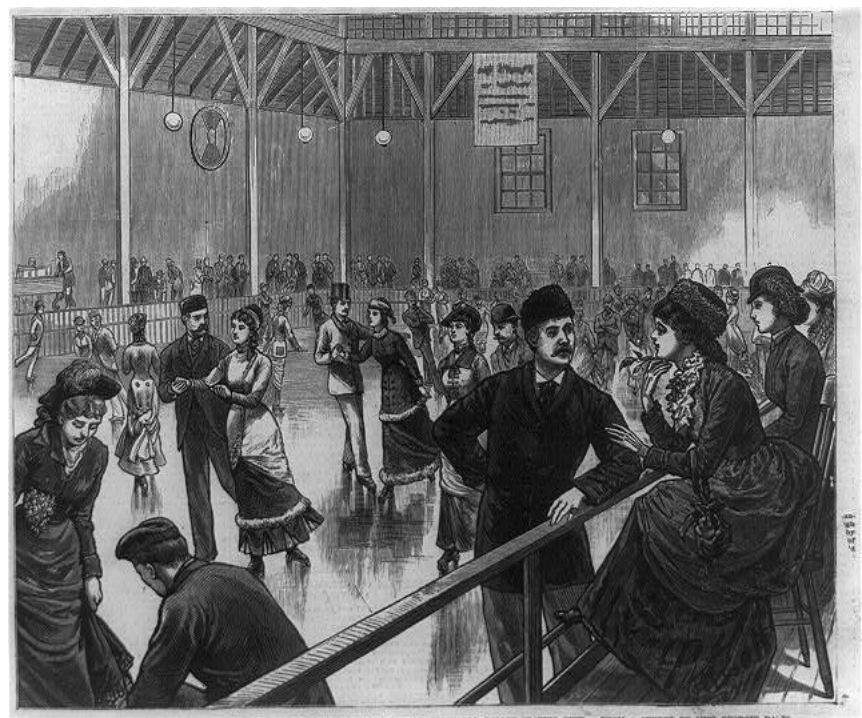
Above, a fashionable roller skating rink in Washington DC, c1880, courtesy of the Library of Congress.

The invention of the "quad skate" (what we think of as a traditional roller skate with two wheels at the front of the skate and two wheels at the back), patented by James Plimpton in 1863, changed roller skating for the