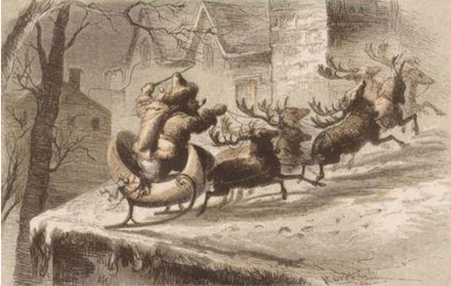
Image from an 1862 edition of A Visit from St. Nicholas

During the 1800s many of our current holiday traditions took shape. The poem A Visit from St. Nicholas by Clement Clark Moore had a big impact on the way we view Christmas. Now referred to by its opening line 'Twas the Night Before Christmas , this poem is responsible for the popularity of Santa Claus, reindeer and stockings.